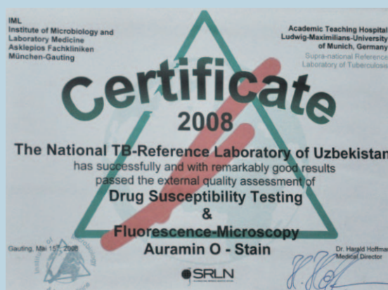
Quality assurance certificate issued to NRL in Tashkent by Institute of Microbiology and Laboratory Medicine at Gauting, Germany.

The twinning of staff at Uzbekistan's National Reference Laboratory with experts at the Gauting laboratory has provided technical support in planning and building the Tashkent laboratory in accordance with international (S 3) biosafety standards. It has also allowed for the training of NRL staff in culture and drug-resistance testing, as well as new diagnostic procedures, and introduced and developed standard operating procedures for quality management systems. Furthermore, twinning has helped the Uzbek NRL develop a quality assurance system, including regular panel testing (cross-check tests) and provided the means for an expert from Gauting to visit the Tashkent laboratory for two weeks, three times a year, from 2007 – 2010.