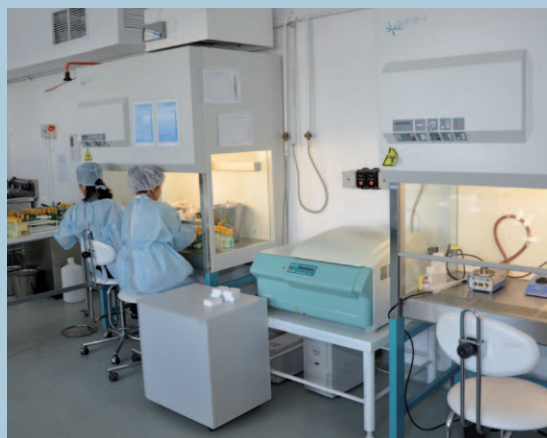
Technicians at new Tashkent NRL: Good hygiene in the workplace, decent salaries and opportunities for advancement help retain qualified personnel and sustain health systems.

No single agency or programme is able to address TB and HIV on its own, as the diseases demand complex, integrated responses from multiple service providers, and few countries with a heavy burden of disease can afford to shoulder all the costs. Well coordinated multiple partnerships are, therefore, required and, ideally, national tuberculosis programmes and national AIDS commissions or authorities should coordinate these. An essential part of this coordination is choosing the right partners for different tasks, so that each is able to make use of its comparative advantage. The CCM can help in this work – and tap into rich sources of funding. WHO has also demonstrated its value as a convener of meetings and source of country guidance.