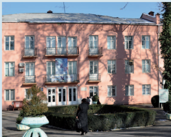
Entrance to TB Hospital No.1, Tashkent.