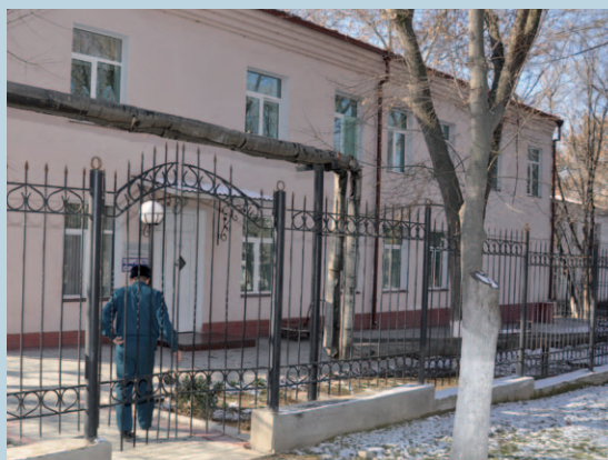
Prisoners on treatment for MDR-TB who have completed their sentences go directly to a special ward in this Tashkent hospital, until cured.

In Georgia, GDC and ICRC have also supported the extension of coverage of TB and HIV services to include prisons. ICRC cooperates extensively with prison authorities in providing prison health services and, most important, ensuring that prisoners continue to receive the health services they need when they return to the wider community. The agency also ensures that TB/HIV co-infected prisoners receive accurate diagnoses and appropriate treatment.