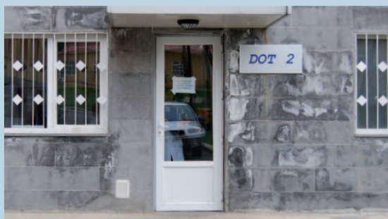
Food and compensation for travel costs are sometimes used as incentives to encourage patients to come for treatment at DOT Spots such as this one in Tbilisi.

Furthermore, the emergence of XDR-TB raises fears of possible TB epidemics for which there could be few treatment options. Little is known about the possible impact of XDR-TB on people with HIV. Outside the Baltic States, Georgia is the first former Soviet country to offer universal access to treatment for multidrug-resistant TB, and this would not have been feasible without a coordinated commitment and investments by national and international agencies. Georgia has developed a joint strategic plan on TB/HIV coinfection with the technical support of KNCV Tuberculosis Foundation and USAID. Georgia's NTP and Uzbekistan's RDC are now fully in charge and coordinate the work of the Stop TB partners with good results. They also collaborate closely with GFATM, to provide second-line drugs for patients with multidrug-resistant TB and/or TB/HIV coinfections. Through the Global Drug Facility, Georgia and Uzbekistan have also procured good quality, inexpensive TB drugs for the first-line treatment. As well, Stop TB's Green Light Committee has helped bring about a 95% reduction in the price of second-line drugs.