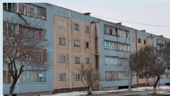
Nurabad, one hour south-west from Tashkent, Uzbekistan: After gaining independence in 1991, Uzbekistan entered a period of economic decline, and poverty, conditions that contributed to an increase in TB.

Independence not only brought a new set of economic challenges for Georgians and Uzbeks, initially it also led to a decline in health services in both countries. In the 1990s, inadequate funding of immunisation, for example, coupled with growing poverty contributed to the spread of various diseases, with TB, malaria and sexually transmitted infections, including HIV, among the most serious health threats. Since the mid 1990s, however, Georgia and Uzbekistan have begun to rebuild and to reinvest in their health sectors.