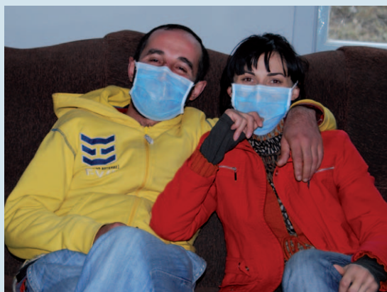
Patients at the Abastumani TB hospital, Georgia.

Germany's support for TB services in prisons has also been viewed as successful. In particular, observers note that GDC's advocacy and investments have catalyzed collaboration between the Ministry of Health and Ministry of the Internal Affairs in Uzbekistan, leading to the extension of TB and HIV services to prisoners and systems to ensure that prisoners continue to receive these services after they are released. This in turn has helped reduce the threat of these diseases among prisoners as well as other vulnerable populations and the general public. In Georgia, too, collaboration between MoH and the Ministry of Justice has had similar positive outcomes.