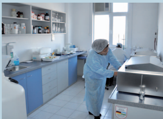
Technician at new National Reference Laboratory, Tashkent.

The twinning of staff at Uzbekistan's National Reference Laboratory with experts at the Gauting laboratory has provided technical support in planning and building the Tashkent laboratory in accordance with international (S 3) biosafety standards. It has also allowed for the training of NRL staff in culture and drug-resistance testing, as well as new diagnostic procedures, and introduced and developed standard operating procedures for quality management systems. Furthermore, twinning has helped the Uzbek NRL develop a quality assurance system, including regular panel testing (cross-check tests) and provided the means for an expert from Gauting to visit the Tashkent laboratory for two weeks, three times a year, from 2007 – 2010.