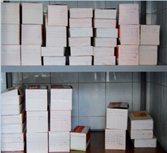
Supplies of first-line TB medicines, such as these at a Tbilisi DOT Spot, have been funded by GDC, helping to build Georgia and Uzbekistan's national TB programmes.

The expansion of DOTS, however, depends not only on drugs; swift, reliable case-detection and bacteriological analysis are equally important. GDC, therefore, gave equal emphasis to helping the NTPs of Georgia, Uzbekistan and other countries in the region build their TB laboratory infrastructure and networks. As a result, Georgia now has a well-developed network of laboratories, with a National Reference Laboratory in Tbilisi, a regional laboratory at the West Georgia Center for Tuberculosis and Lung Diseases, 30 first-level microscopy laboratories and 37 sputum collection points. It also has state-of-the-art equipment and a reliable system for transporting sputum samples from collection points to first-level facilities for smear microscopy, to regional laboratories for culture, and to national reference laboratories for drug-sensitivity testing. With German support, Georgia is now building and equipping a new national reference laboratory to allow for rapid diagnosis of multi-, and extensively, drug-resistant TB, among other tasks.