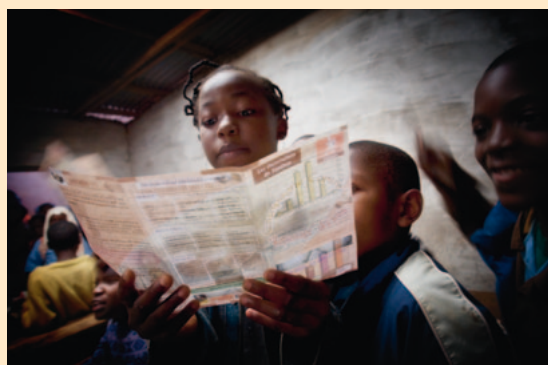
School children reading Aunties' information leaflet.

During interviews, potential recruits are told that their participation is voluntary, that there is no pay involved (unless interviewees reveal they need small per diems and reimbursements for expenses) and the training is not geared towards preparing them for jobs. On leaving, they are usually given pamphlets or flyers with basic information on sexual and reproductive health and the Aunties' Project.