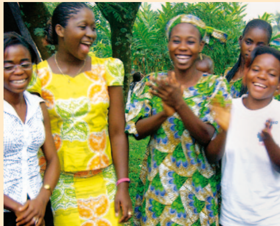
Aunties from different associations singing at a meeting.

» The Auntie' Project is transferable, not just from locality to locality within Cameroon but also to other countries.