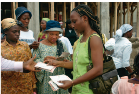
Auntie distributing flyers against breast-ironing.

Breast ironing is done by the girls' mothers, grandmothers, older sisters or other female relatives. It is meant to protect them from sexual attention but many with ironed breasts become pregnant anyway and are forced to leave school and get married, undergo unsafe abortion or give birth outside of marriage. Besides being extremely painful and traumatic, breast ironing leaves permanent tissue damage and deformity. While the long-term consequences have yet to be studied, they may include infections, cysts, cancer and the need for breast removal or other surgical procedures.