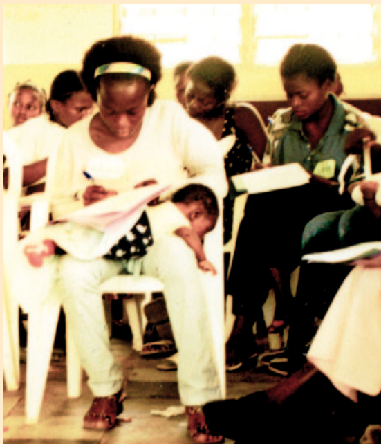
At the beginning of the project, Aunties attending training were using their babies as desks. Since then, nannies are hired to take care of babies during training sessions.

Initially the Ministry of Health and Ministry for Women's Empowerment and the Family provided senior trainers to run these sessions. The Aunties' Project, however, swiftly developed its own cadre of senior trainers, drawing on the best of the trained and experienced Aunties. During training workshops, these trainers meet in committee with project staff to review content, methods and results and, as appropriate, make daily adjustments.