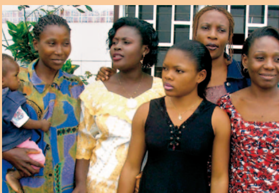
Members of the Mamfe Aunties Association

Urbanization, modern transportation and communications, globalization of youth culture, poverty, and disparities between rich and poor have undermined such traditions. Girls in Cameroon have followed worldwide trends towards sex before marriage with multiple partners – often out of need for food, shelter or clothing. This means they are at high risk of getting pregnant, unsafe abortion and sexually transmitted infections (STIs), including HIV, as well as in danger of being removed from school or forced into early marriage.